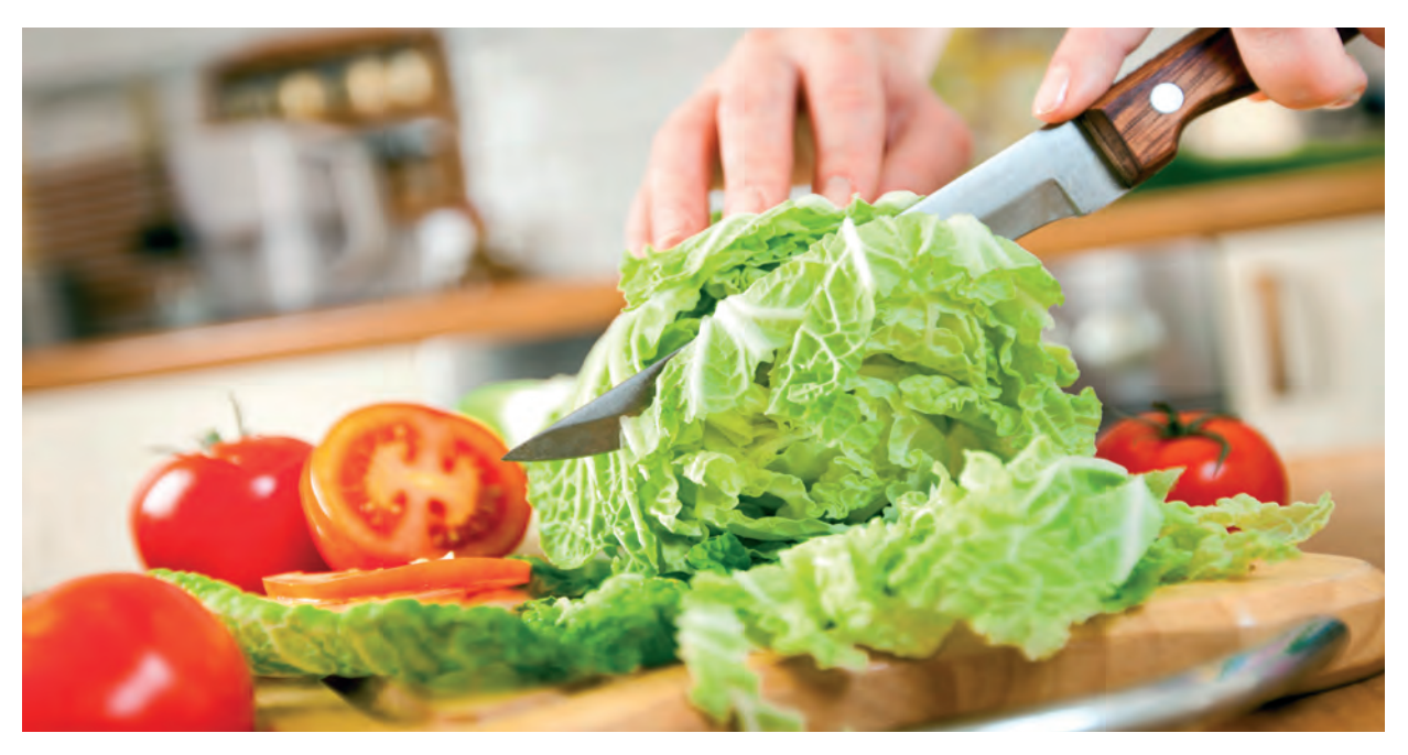
Some other useful tips for modifying recipes